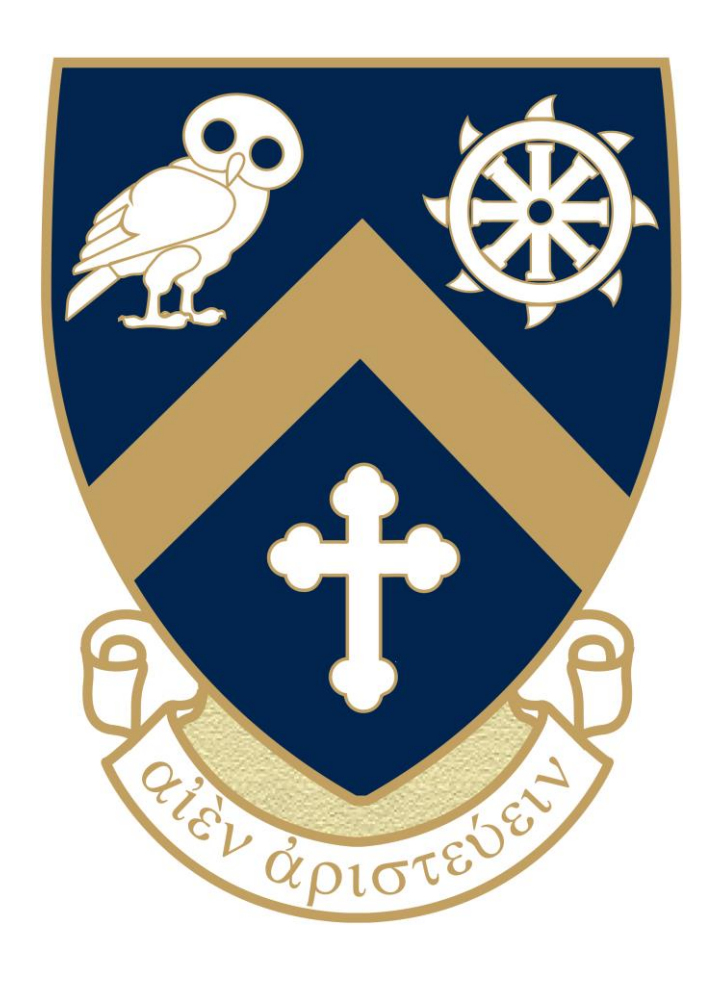
~ Ever to Excel ~